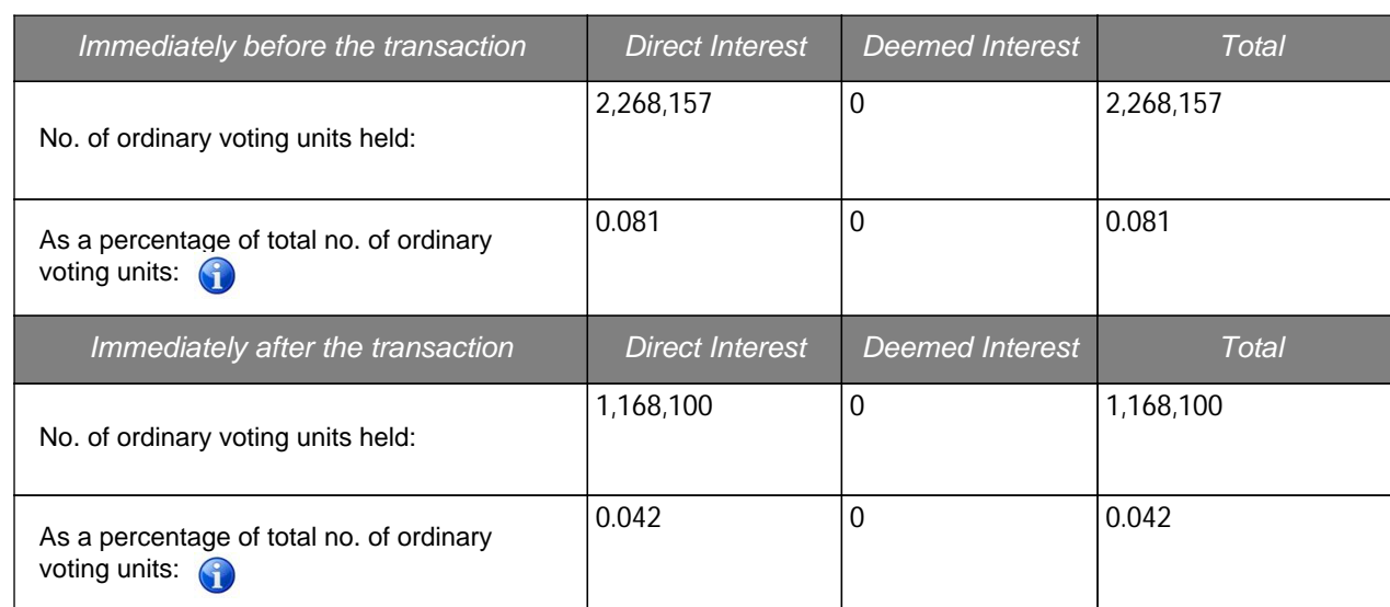
Table 1. Change in respect of ordinary voting units of Listed Issuer